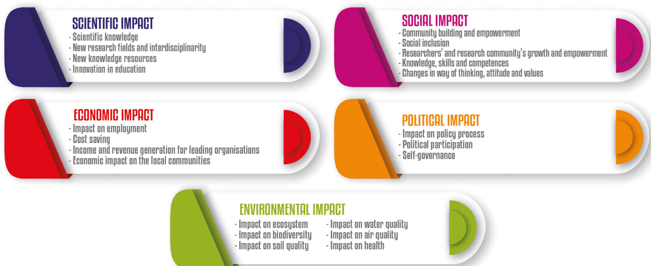
Figure 1 ACTION areas of impact and dimensions

As mentioned in the previous section, the methodology considers five areas of impact: scientific, social, economic, political and environmental. It also considers the transformative potential of the citizen science projects. Each area of impact is articulated in several dimensions: 24 overall (Figure 1). Each dimension is operationalised in different variables. The methodology is quali-quantitative: each dimension is operationalised considering how well it can be expressed in numerical or non-numerical terms following a mixed-method approach (Tashakkori et al., 2010a).